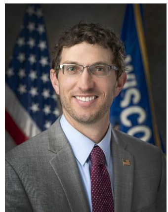
Rep. Travis Tranel