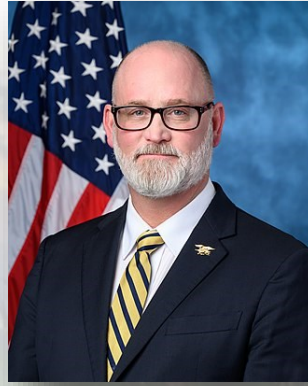
Rep. Derrick Van Orden