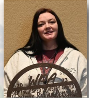
Heritage Swine Genetics