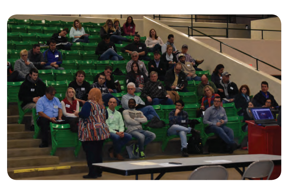
Over 115 producers and youth attended the Badger Swine Symposium held at Arlington Ag Research Station. The event provided an opportunity for producers to learn more about current swine industry topics and ways to make improvements to their farming operations. The event also included updates on swine research being completed at UW-Madison.

P.O. Box 327, 131 S. Monroe St. Lancaster, WI 53813 (608) 723-7551 or 1-800-822-7675 www.wppa.org | Facebook.com/wipork