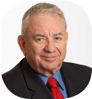
Tommy Thompson, Interim UW System President