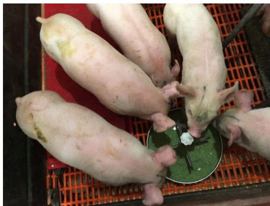
Creep feed with a color indicator (chromic oxide; green color) offered to suckling piglets. Piglets were curious on the creep feed, and tried to consume and play with it (in the first project at UW- River Falls).