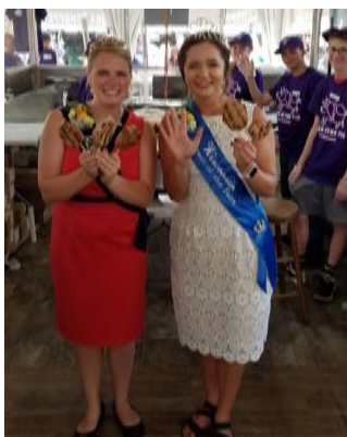
Alice in Dairyland and Fairest of the Fair enjoy a pork chop on a stick during day 5 of the Wisconsin State Fair