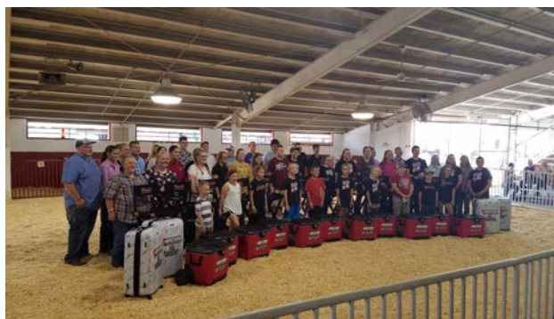
Wisconsin Show Pig Association Youth Award Recipients